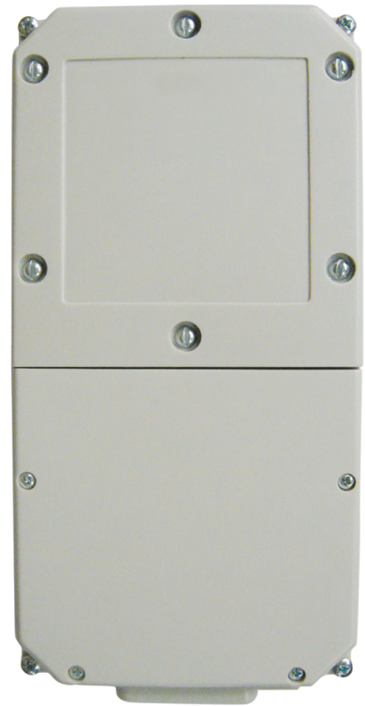
For the cut-line use Globalstar SmartOne Data Modem

Carmanah designs, develops, and distributes a portfolio of products focused on energy optimized LED solutions for infrastructure and solar-powered engines for remote asset tracking devices and data transmissions. Since 1996, the company has earned a global reputation for delivering durable, dependable, efficient, and cost-effective solutions for industrial applications that perform in some of the world's harshest environments. In 2014, Carmanah purchased Sol Inc, another solar outdoor LED lighting company formerly based in Florida, which is now a wholly owned subsidiary of Carmanah. For more information, visit www.carmanah.com/telematics and www.solarlighting.com .