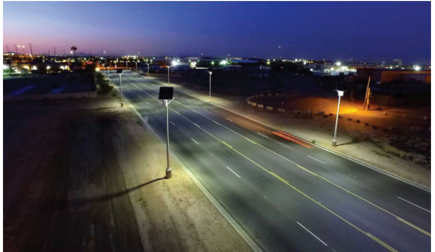
The Sol EverGen offers reliable lighting solutions for perimeter, security, street, pathways, parks, parking lots, and general area lighting for outdoor applications.

Savvy asset managers within government and industrial-based organizations are continually looking for ways to affordably monitor and manage critical data from their remote assets. Innovative solution providers working on the